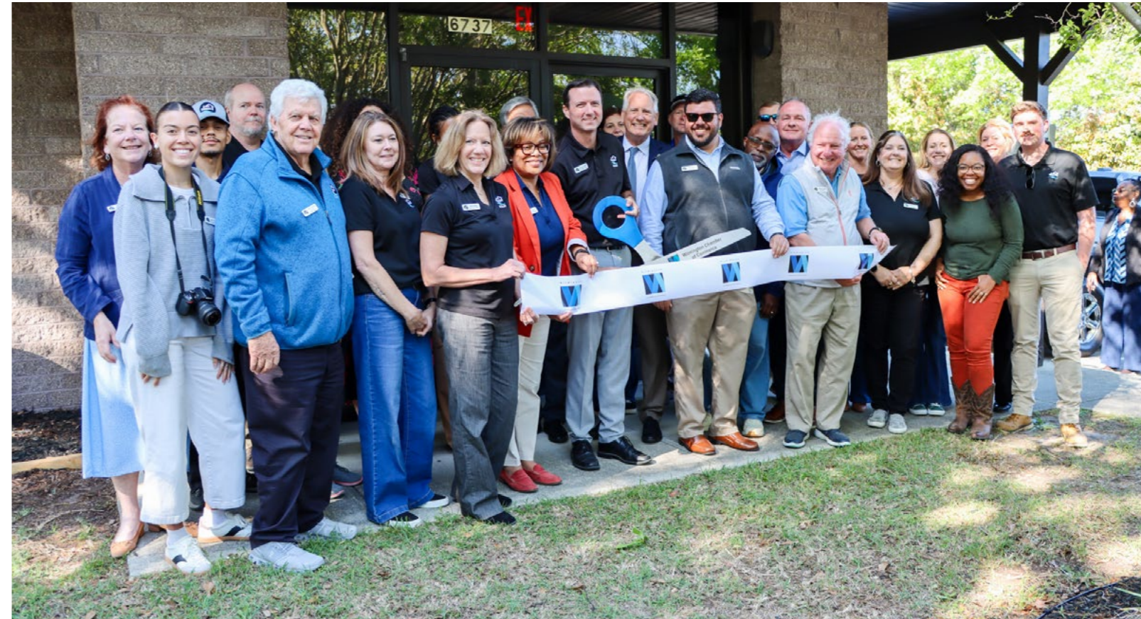
◇ WARM NC Office during renovation. ◇ WARM NC Ribbon Cutting.