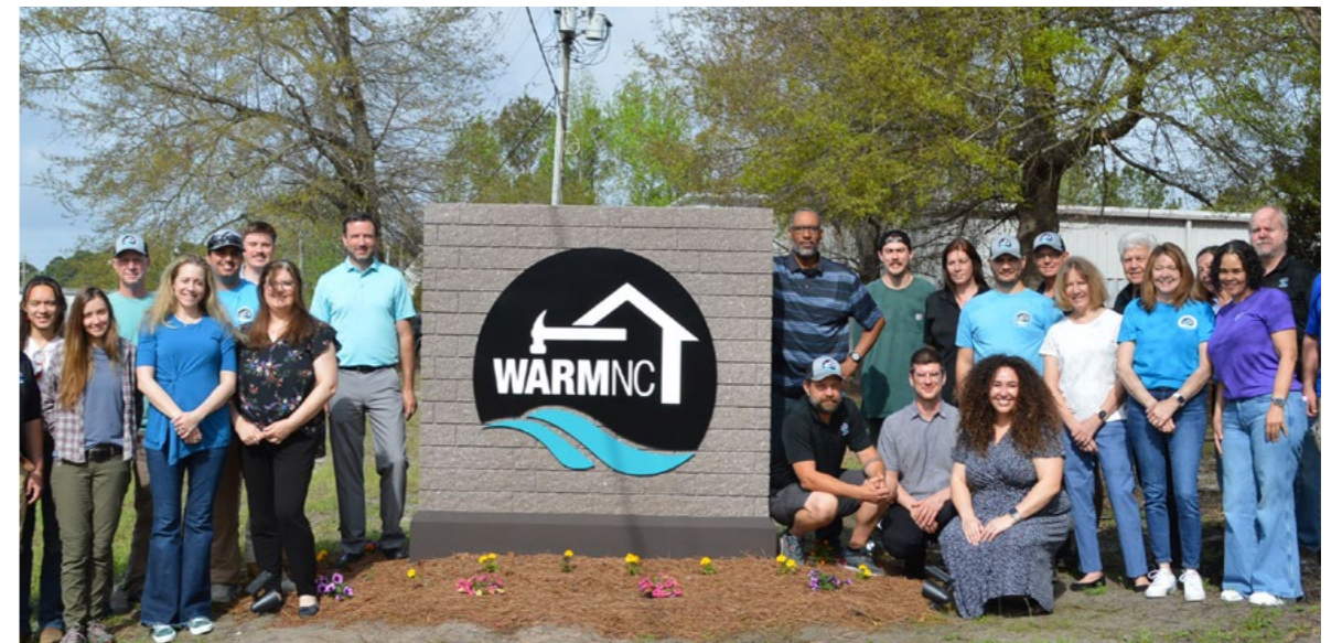
◇ WARM NC staff.