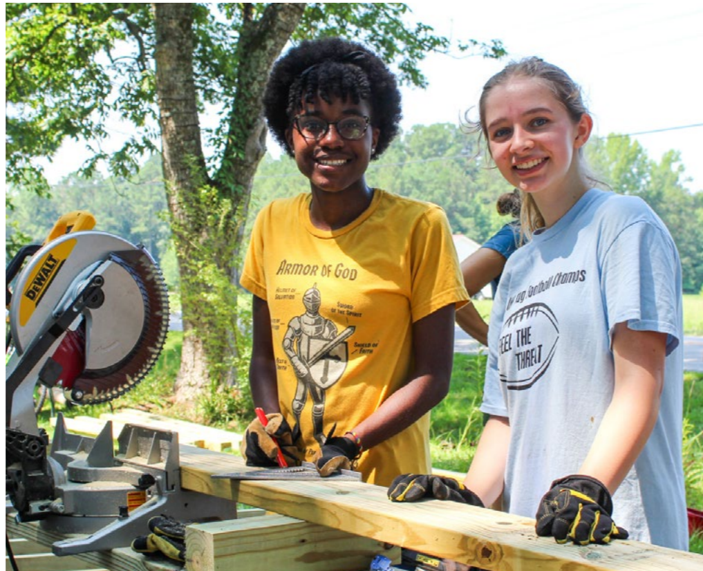
◊ Volunteers from Praying Pelican Missions volunteering in Columbus County, NC.