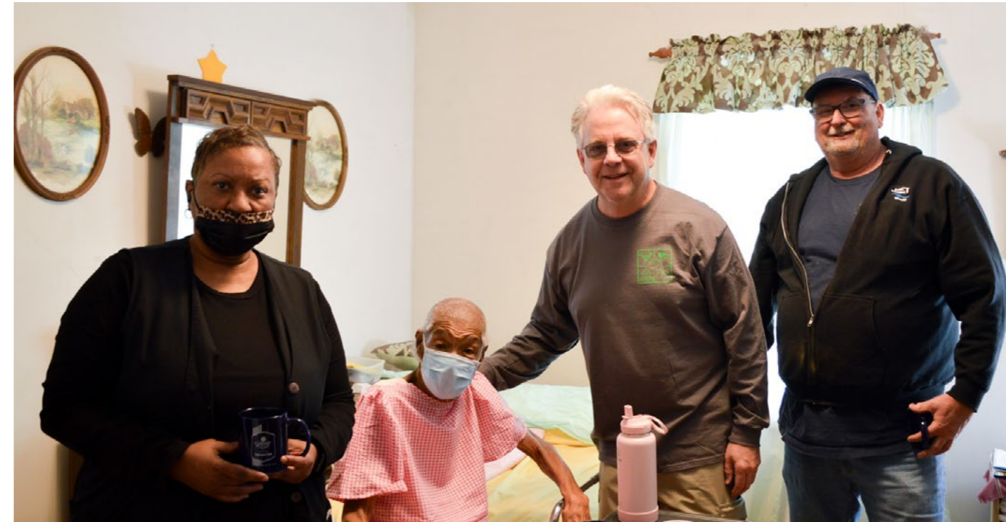
◇ WARM NC staff and volunteer with homeowner.

The Urgent Repair Program addresses housing conditions that pose an imminent threat to the life or safety of very low-income homeowners with special needs. Its purpose is to eliminate urgent hazards and prevent displacement by providing essential safety and accessibility modifications.